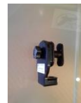
BLK2GO Adapter (Art. ADP-BLK2GO) to be ordered separately