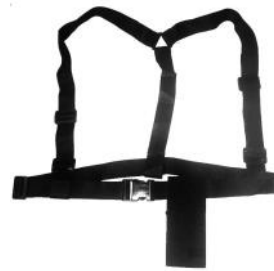
Rod Holder Belt