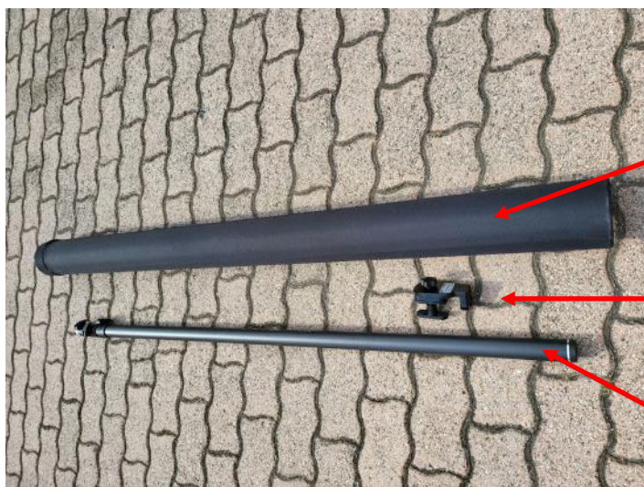
Hard carry case