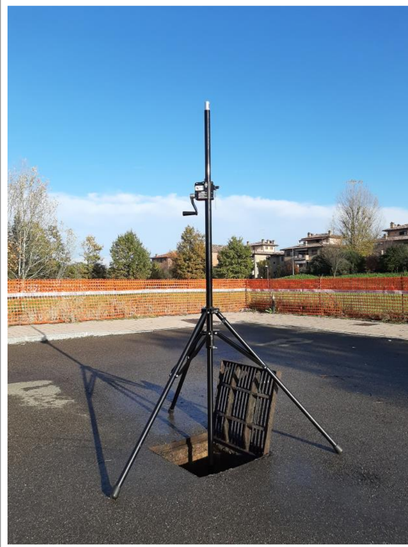
Two-way steel tripod